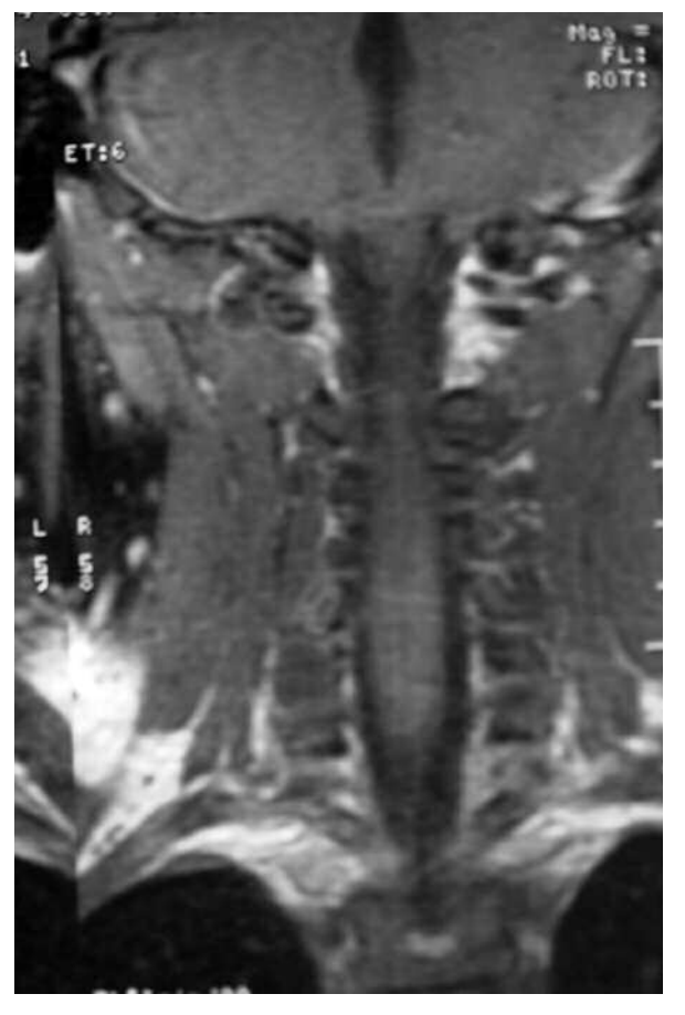
Fig. 2. Postoperative coronal T1-weighted MRI with contrast reveals complete resection of the tumor seen in Figure 1

Histologically, proliferation of sheets of epithelioid tumor cells with vesicular nuclei and eosinophilic cytoplasm with indistinct cell borders were enmeshed in dense connective tissue. The neoplasm was nodular